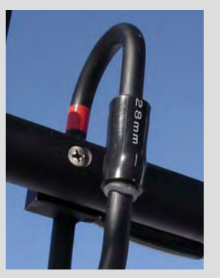
Sealed feed point