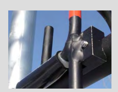
Unique dipole (DE) block mount and fully sealed feeder